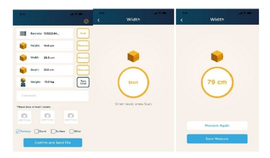
Figure 4: Screenshot of BoxSize

We have developed the "Two Shots", an algorithm that is intended to make package measurement even faster through two measurements, to measure the height, width and depth, of a package rather than three separate measurements.